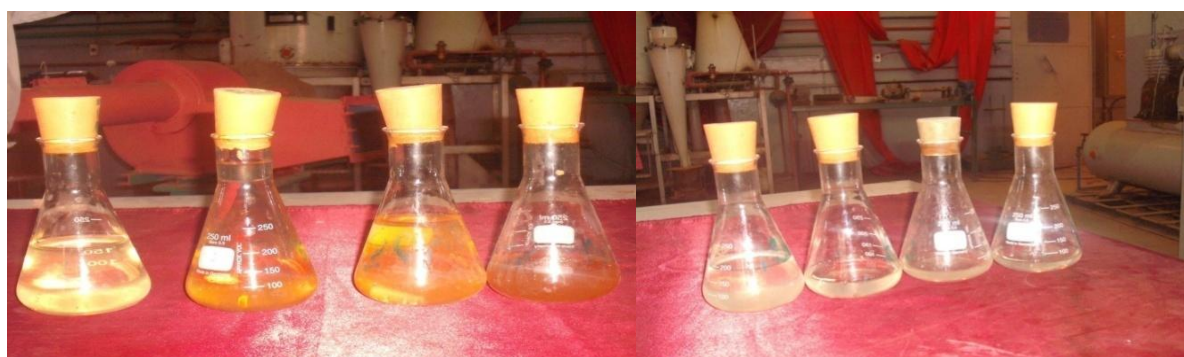
Figure (2). Color of raw (left) and treated (right) acacia Seyal Solutions.